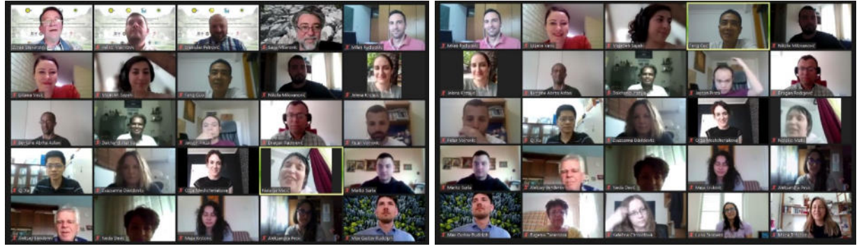
Attendances at the end of Conference "Karst: From Top to Bottom"

(http://gabp-dl.rgf.rs) or "Compte rendu de la Société Serbe de géologie" (https://sgd.rs/en). The Book of Abstracts is available for download on the CKH website.